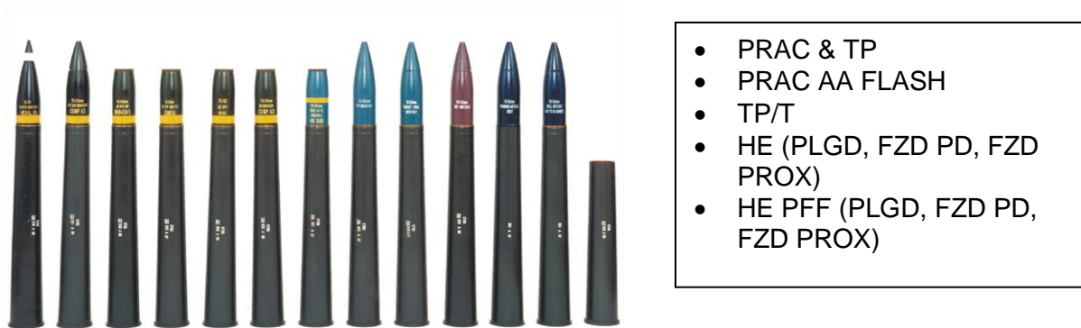
Figure 2: 76/62mm ammunition types 9