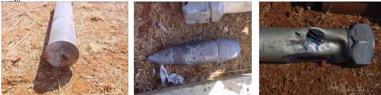
Figure 3: Sympathetic denotation results in packaged configuration (mono pack) for 76/62mm 10

The packaging plays an important role in mitigating sympathetic detonation. The SA Navy employs the mono-pack which is an aluminum container. During sympathetic detonation tests a “type V (no reaction) was obtained and this is because the transfer of the detonation from the donor to the acceptor was mitigated by the aluminium wall of the mono-container that deformed and absorbed some of the energy. This prevented the violent reaction. It is evident that just by changing the packaging that IM can be achieved on a system level” 10