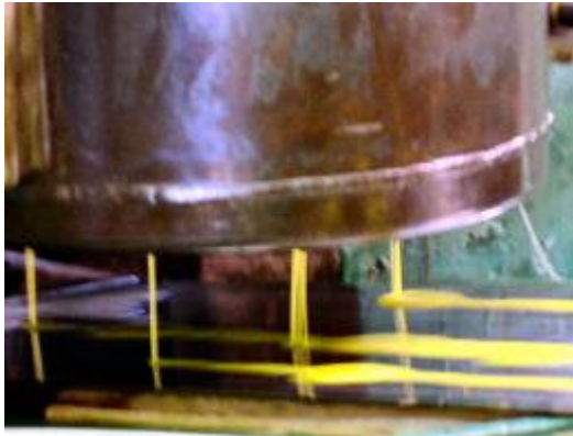
Figure 12 Casting of IMX-104 onto Flaker Belt