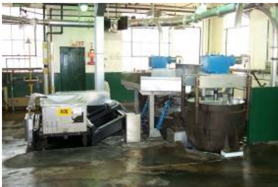
Figure 9 Production Scale Melt Kettle