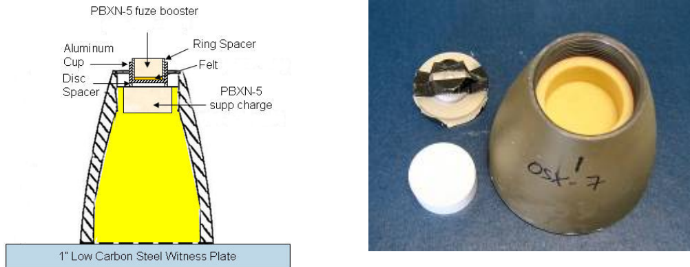
Figure 2 Initiation and Function Test Hardware and Set Up

Both IMX-104 and PAX-48 achieved high order detonation, in a similar manner to Composition B. A clean hole with diameter similar to the 120mm Mortar ogive section was found on all candidates. Photos of the pre and post initiation test can be found in Figure 3, 4 and 5.