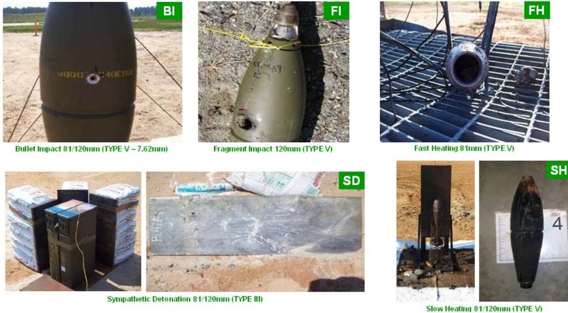
Figure 8 Images of IMX-104 IM Mortar Systems Test Result