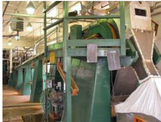
Figure 13 Flaker Belt