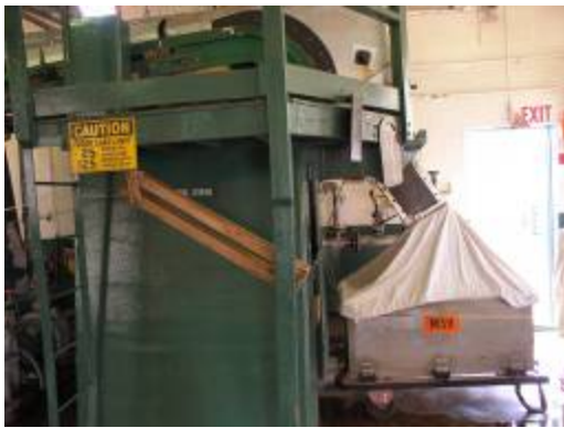
Figure 14 Product Flake Exit Belt