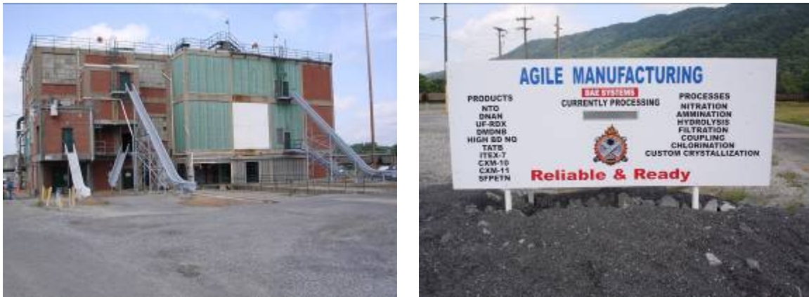
Figure 1 The Agile Facility (Building G-10) at HSAAP

In the OSI selection process, potential candidates are evaluated in terms of performance (using performance prediction model), shock sensitivity (NOL Large Scale Gap Test), and processability (Efflux viscosity). The goals for the explosive candidates to achieve were: