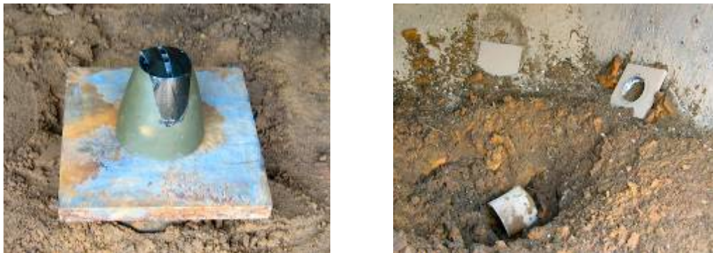
Figure 3 Initiation and Function Test of IMX-104

Both IMX-104 and PAX-48 achieved high order detonation, in a similar manner to Composition B. A clean hole with diameter similar to the 120mm Mortar ogive section was found on all candidates. Photos of the pre and post initiation test can be found in Figure 3, 4 and 5.