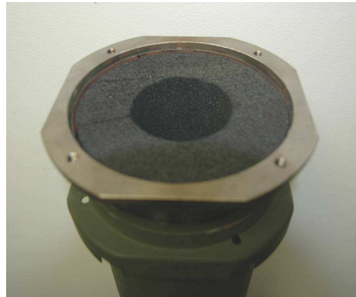
b. Prior to insertion of pressure release panel