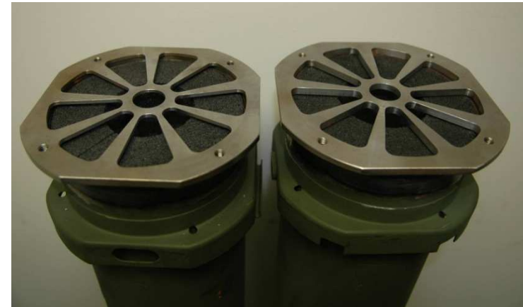
c. Left container mesh is 1/8" thick Right container mesh is 1/4" thick