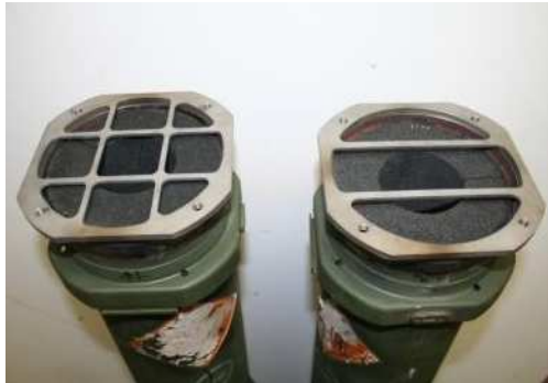
a. Pressure release panel with mesh