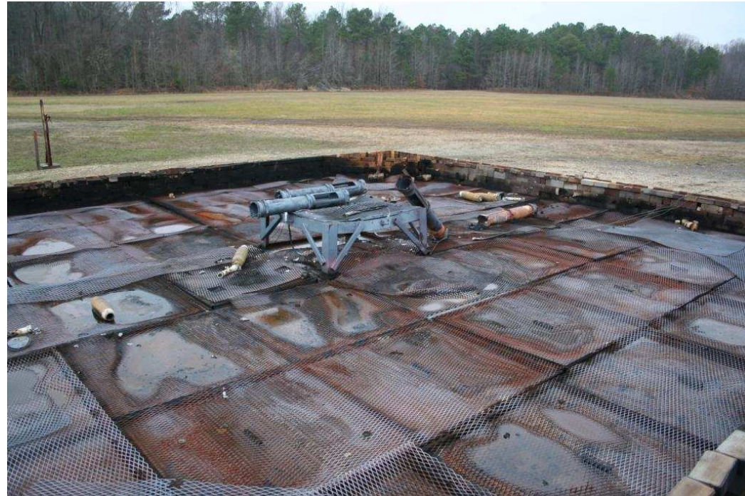
c. Post Test Results