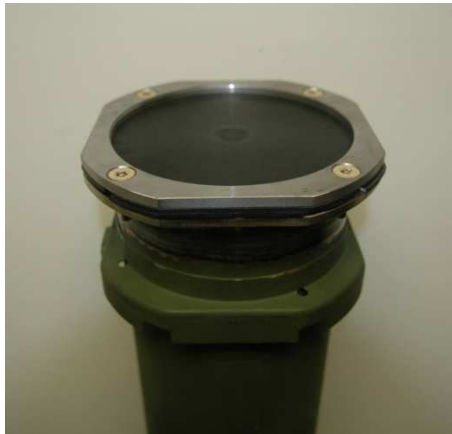
a. Pressure release panel